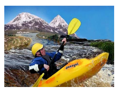
Some contacts include: <a href="https://www.doneaglcanoeclub.com">www.doneaglcanoeclub.com</a> <a href="https://www.extremesports.ie">www.extremesports.ie</a>