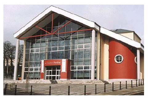
Theatre An Grianán Theatre, Port Road, Letterkenny www.angrianan.com

Library and Arts Centre - Oliver Plunkett Road, Main Street, Letterkenny www.donegallibrary.ie/libraryguide/default.htm