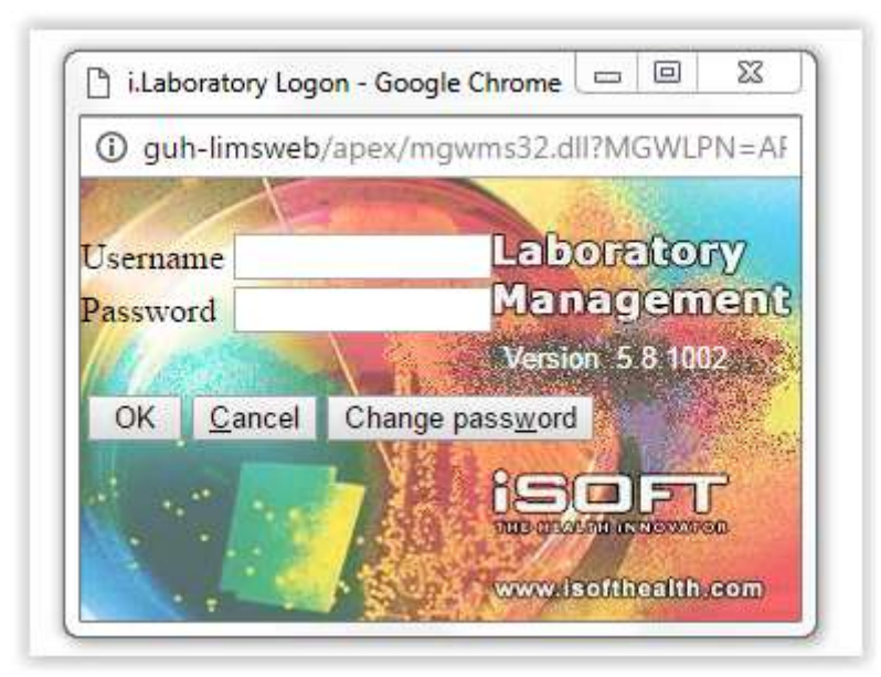
Figure 5. Log on screen for Web ward enquiry.

After entry of username and password the user can search using either the PID (Patient Identification) number and first 2 letters of surname or an unknown search using a combination of name/DOB/Sex . See Figure 6 below.