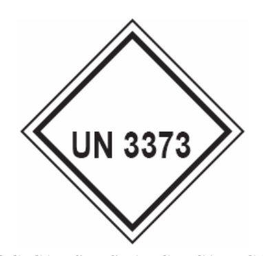
BIOLOGICAL SUBSTANCE, CATEGORY B