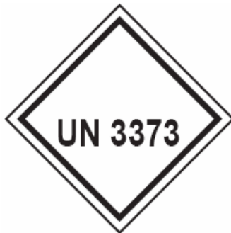
BIOLOGICAL SUBSTANCE, CATEGORY B

14.4.3. For carriage, the outer packaging must be marked with UN 3373 and 'Biological Substances, Category B' marked adjacent to the diamond shaped mark.