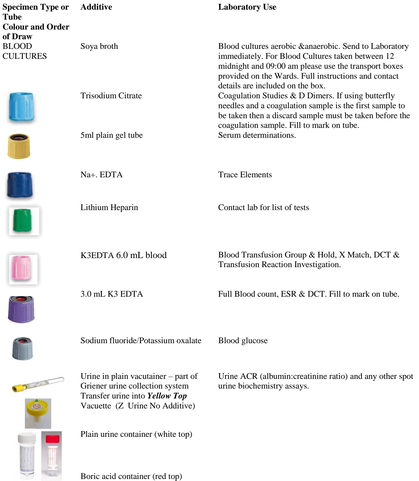
Table 6: Order of venipuncture.

Always ensure sample containers are in date.