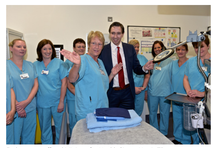
Endoscopy staff and Minister for Health Simon Harris TD

The development of the new Endoscopy Unit is a key element to the progression of Roscommon University Hospital. The unit is accredited by the Joint Advisory Group on Gastrointestinal Endoscopy (JAG) and is an approved centre for Bowel Screening under the governance of the National Screening Service – Bowel Screening Programme. The new unit will have enhanced capacity for both symptomatic and screening patients and this will impact significantly on the early diagnosis and treatment of colorectal cancer.