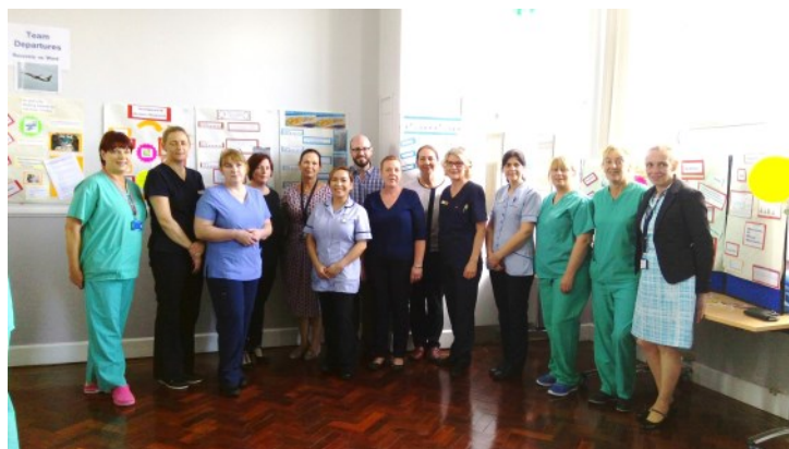
Members of the Scheduled Theatre Flow Rapid Improvement Project.

PUH staff held the 30 day report out on 20 September.