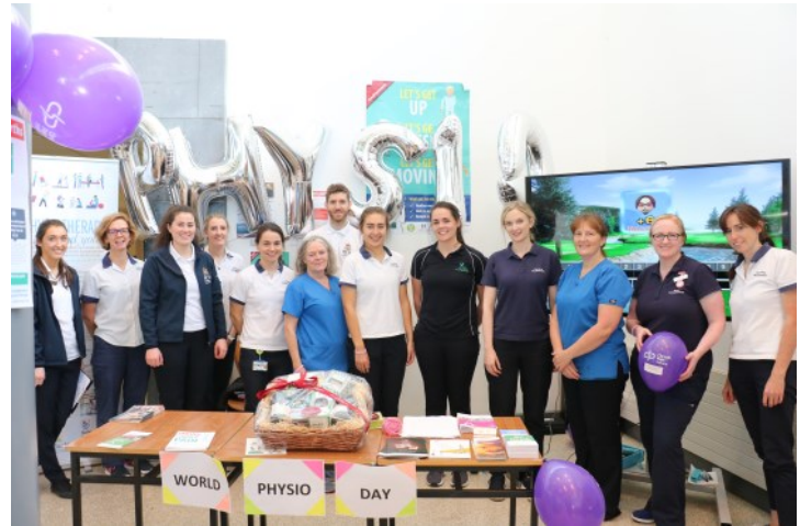
World Physio Day in UHG with staff providing information on the role of physiotherapy in the management of chronic pain.