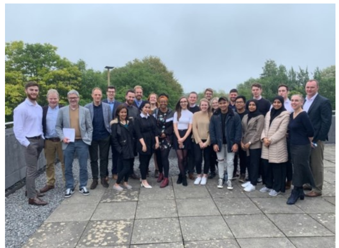
The 2018/19 class together with GUH/NUI Galway MPCE/Physics staff after their recent project presentations.

The programme has International accreditation and in the past academic year had 26 students including a number of students from the USA, Canada and Saudia Arabia.