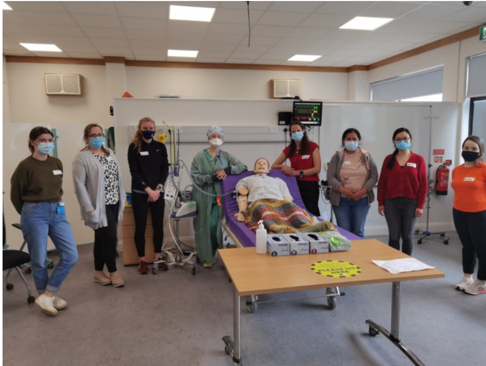
First participants in the Hi-fidelity Tracheostomy Simulation Programme at GUH in May.

The programme will be running four times per year and is open to all Saolta Hospital Group staff. To book a place on the next programme, please contact the CNME office in Galway by emailing cnme.guh@hse.ie