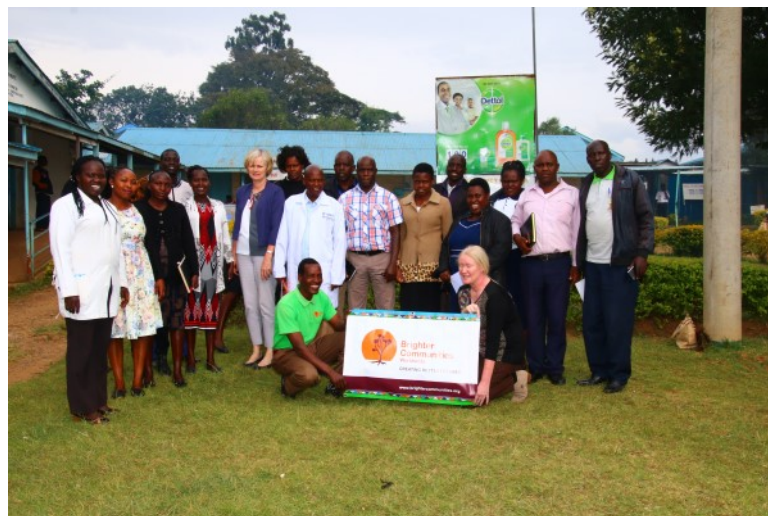
Staff from Mayo University Hospital and Londiani Sub-County Hospital, in Kericho County, Kenya. MUH staff are fundraising to upgrade the Special Care Baby Unit in the hospital.

On the 29 November MUH staff walked, jogged and ran 5km to raise funds for a life-saving project in Londiani Hospital in Kenya. Mayo University Hospital has a long-standing relationship with Londiani Sub-County Hospital in Kericho County.