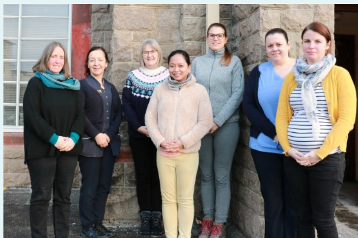
Health Literacy Committee members in GUH.