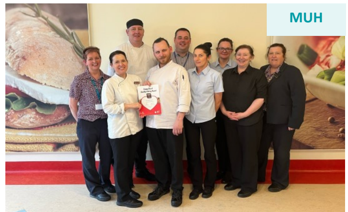
The catering team in MUH.